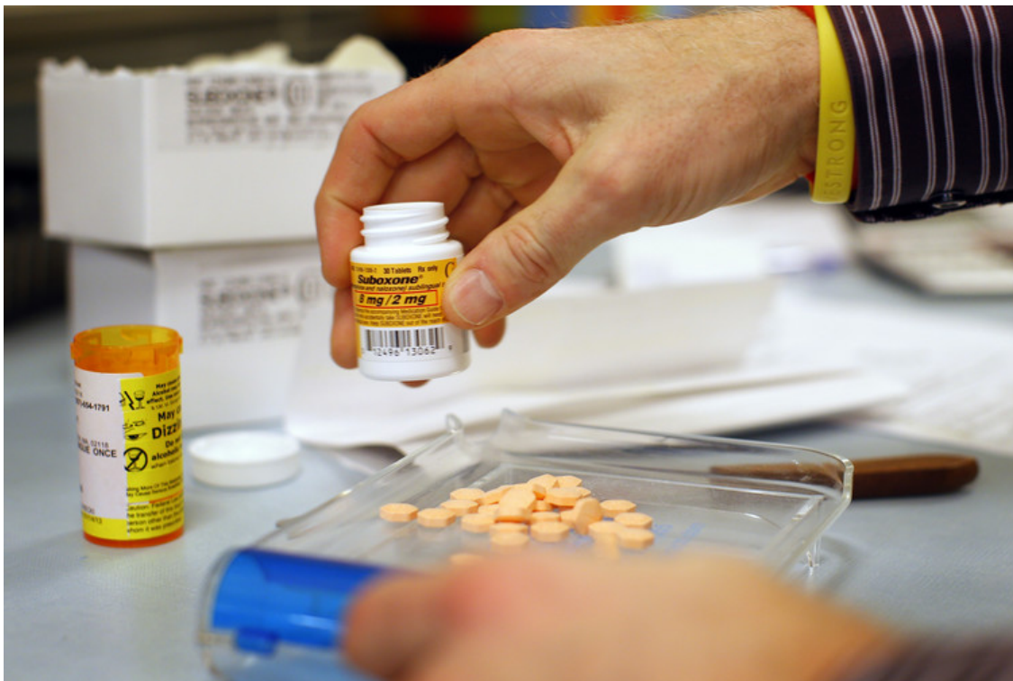
A pharmacist fills a Suboxone prescription at Boston Healthcare for the Homeless Program. Drug therapies can help, but are rarely sufficient for recovery alone.

In treatment, medications like methadone and buprenorphine for opiate dependence, or Antabuse or naltrexone for alcoholism, can certainly help suppress withdrawal and craving, but rarely are they sufficient in the absence of counseling or therapy to help patients achieve lasting recovery. Motivation is essential to make needed changes.